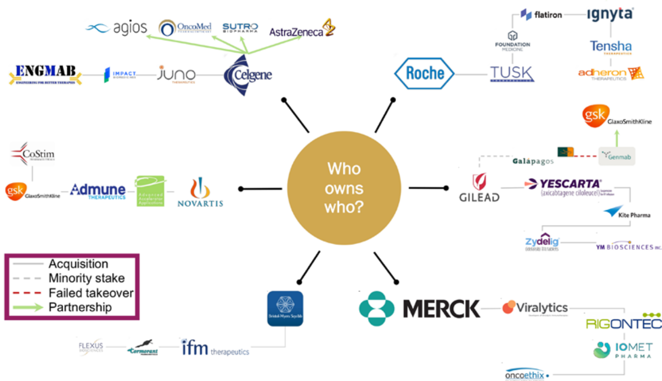
FIGURE TWO - WHO OWNS WHO: MAJOR ONCOLOGY ACQUISITIONS, 2013-2018 MAJOR M&A DEALS AND PARTNERSHIPS ARE BOLSTERING THE ONCOLOGY PIPELINE FOR BIG PHARMA

SOURCE MERGERMARKET; COMPANY WEBSITES; CANDESCIC RESEARCH AND ANALYSIS